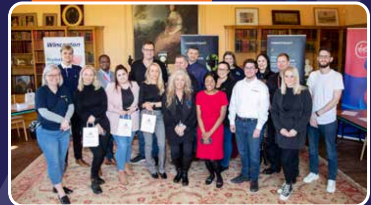
Brackmills BID Jobs Fair