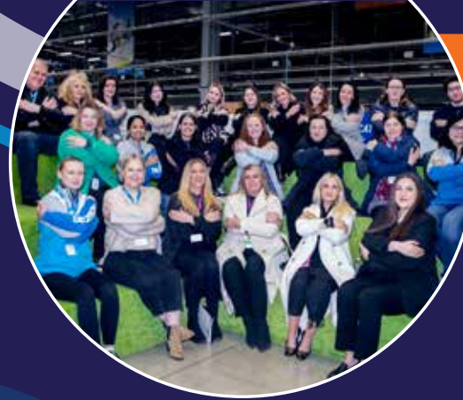
Brackmills Networking Breakfast International Women's Day

Our dedicated website, which we are constantly improving and investing in, is complete with a business directory, events and news.